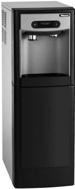
Shown with optional base stand